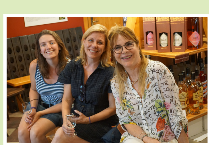
Goûtons voir si le vin est bon

We'll continue in the classroom with France's complicated history of immigration, covering such topics as la laïcité , present-day assimilation/integration, and the teaching of French to immigrants. We'll punctuate the lesson with an afternoon visit to the stimulating musée d'histoire de Nantes , found in the Château des Ducs de Bretagne.