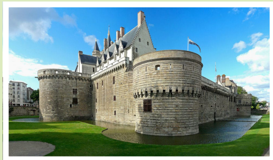
Nantes : Chateau des Ducs de Bretagne, en plein centre ville