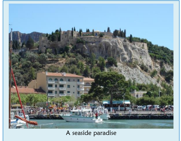
A seaside paradise