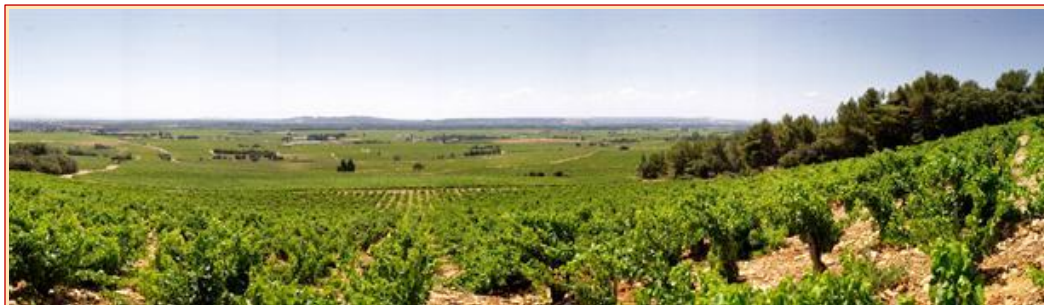
The lush terroir of the area gives the wines of Chateauneuf their distinct flavor

The French Traveler reserves the right to make changes to this itinerary as necessary. Final itinerary will be mailed to participant before trip.