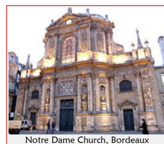
Notre Dame Church, Bordeaux