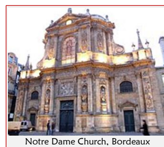
Notre Dame Church, Bordeaux